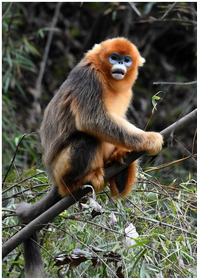
Golden Snub-nosed Monkey

In the early morning, we come to the restaurant and get breakfast ready in the lobby of the hotel where Susan and Phil stay. After breakfast, we drive towards Panda Valley to photograph Golden Monkey. While we are driving along the winding road, I keep looking for any birds that appeared along the river. After a while, we decide to stop and walk along the road so as to get a closer look, we find Common Kingfisher standing on the top of road ready to target at any fish appear from the small pond by the side of the rock and a Crested Kingfisher standing on another rock about 5 meters away. While we are searching Susan finds a Forktail which she is not very sure, because the bird keeps moving between the rocks and occasionally showing Susan small part of its body. We try to get a nice view from different angle and eventually I get full view, it is Little Forktail.